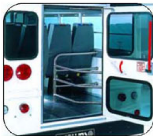
There are a number of options available

Everything you could imagine in the largest and best school buses, and many things you can only get in a plush conversion van.