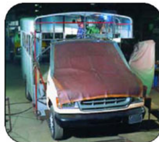
Steel construction safety cage for added strength and peace of mind

Collins builds the Collins Child Care Bus from the chassis up, engineering safety into every square millimeter. Available in single rear-wheel 9,600 lb. GVW, it features a reinforced, galvanized steel body, for bus-like protection in both head-on and side collisions. It also offers a smoother, sturdier ride, for added comfort and safety, with special child restraint seats to protect your precious passengers.