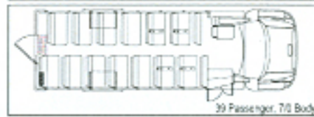
39 Passenger, 7/0 Body