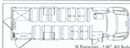
36 Passenger - 1 WC, 8/0 Body