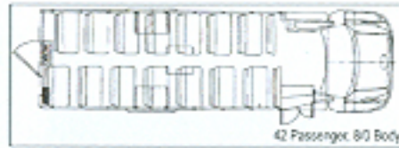
42 Passenger, 8/0 Body