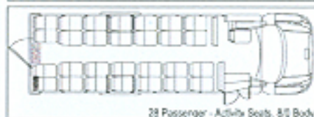
28 Passenger - Activity Seats, 8/0 Body